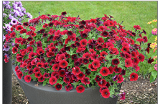
Supertunia Black Cherry Petunia in bloom