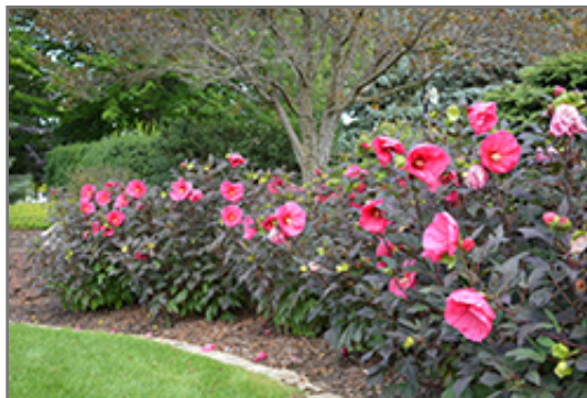
Summerific Evening Rose Hibiscus in bloom