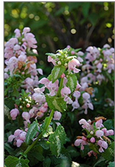
Shell Pink Spotted Dead Nettle flowers