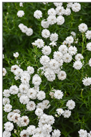
Peter Cottontail Yarrow flowers