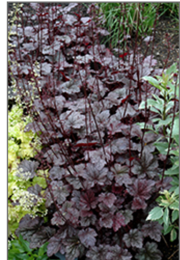
Plum Pudding Coral Bells in bloom