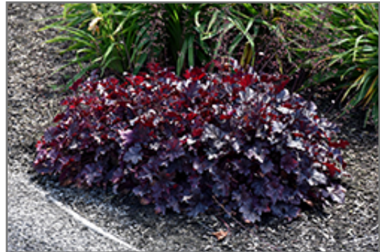
Plum Pudding Coral Bells

Plum Pudding Coral Bells is a fine choice for the garden, but it is also a good selection for planting in outdoor pots and containers. It is often used as a 'filler' in the 'spiller-thriller-filler' container combination, providing a mass of flowers and foliage against which the larger thriller plants stand out. Note that when growing plants in outdoor containers and baskets, they may require more frequent waterings than they would in the yard or garden.