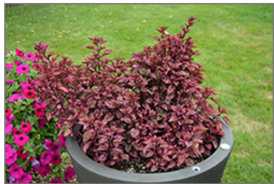
Hippo Rose Polka Dot Plant