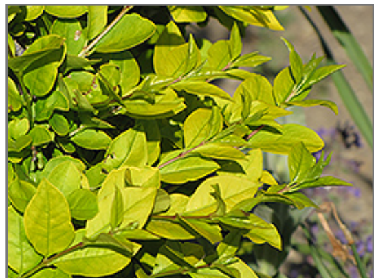
Golden Privet foliage