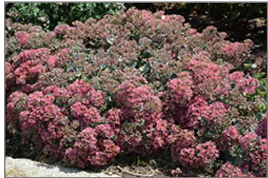
Popstar Stonecrop in bloom