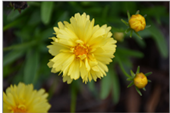
Leading Lady Charlize Tickseed flowers

Leading Lady Charlize Tickseed is recommended for the following landscape applications;