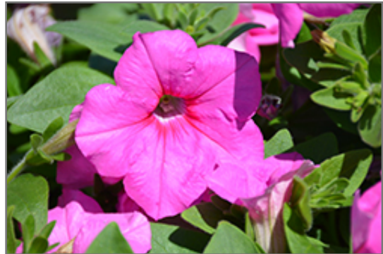
Easy Wave Pink Passion Petunia flowers

This plant will require occasional maintenance and upkeep. Trim off the flower heads after they fade and die to encourage more blooms late into the season. It is a good choice for attracting bees and hummingbirds to your yard, but is not particularly attractive to deer who tend to leave it alone in favor of tastier treats. It has no significant negative characteristics.