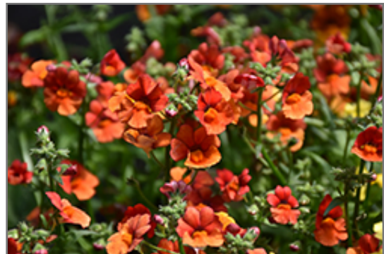
Sunsatia Blood Orange Nemesia flowers