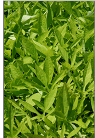
SolarPower Lime Sweet Potato Vine foliage