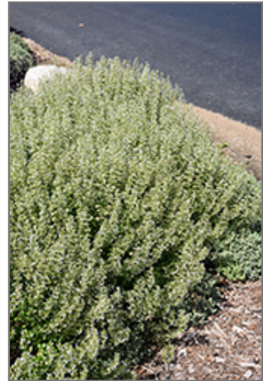
White Cloud Dwarf Calamint in bloom