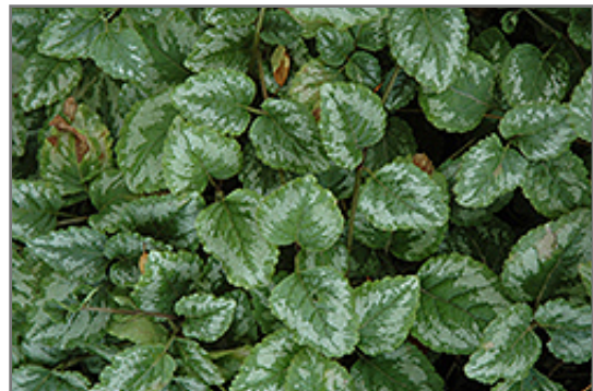
Jade Frost Archangel foliage