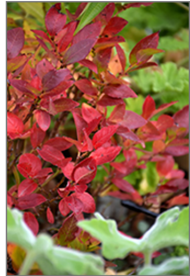
Jelly Bean Blueberry in fall

Jelly Bean Blueberry features dainty clusters of white bell-shaped flowers with shell pink overtones hanging below the branches in mid spring. It has red-variegated green foliage. The glossy oval leaves turn an outstanding red in the fall. It features an abundance of magnificent blue berries in mid summer.