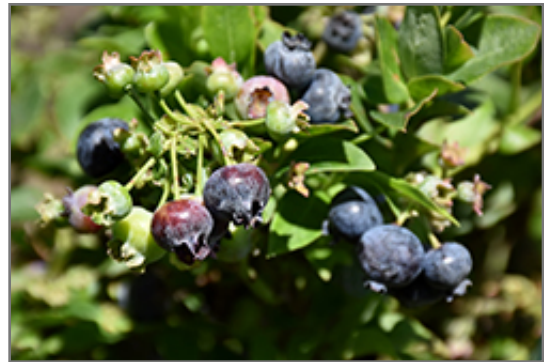
Jelly Bean Blueberry fruit