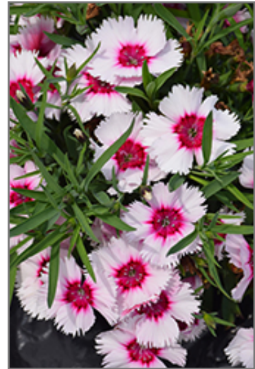
Super Parfait Raspberry Pinks flowers

Super Parfait Raspberry Pinks is a fine choice for the garden, but it is also a good selection for planting in outdoor pots and containers. It is often used as a 'filler' in the 'spiller-thriller-filler' container combination, providing a mass of flowers and foliage against which the thriller plants stand out. Note that when growing plants in outdoor containers and baskets, they may require more frequent waterings than they would in the yard or garden.