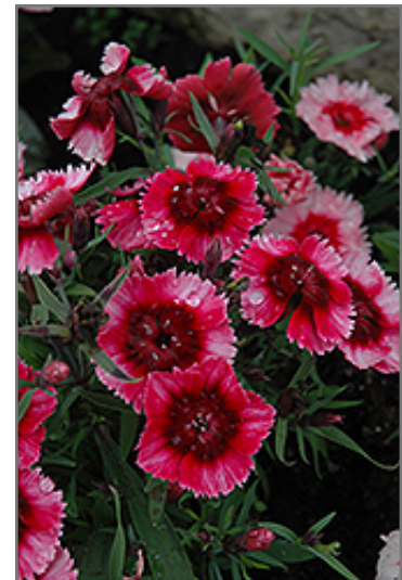
Super Parfait Raspberry Pinks flowers