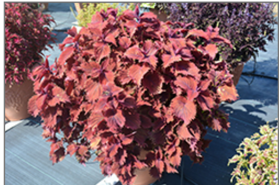
Under The Sea King Crab Coleus