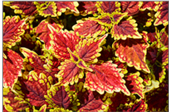
Oxford Street Coleus foliage

Oxford Street Coleus is recommended for the following landscape applications;