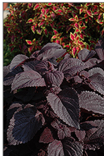
ColorBlaze Dark Star Coleus foliage