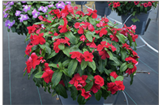
Titan Dark Red Vinca in bloom

Titan Dark Red Vinca is a fine choice for the garden, but it is also a good selection for planting in outdoor containers and hanging baskets. It is often used as a 'filler' in the 'spiller-thriller-filler' container combination, providing a mass of flowers against which the thriller plants stand out. Note that when growing plants in outdoor containers and baskets, they may require more frequent waterings than they would in the yard or garden.