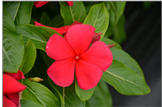
Titan Dark Red Vinca flowers

This plant will require occasional maintenance and upkeep, and should not require much pruning, except when necessary, such as to remove dieback. It is a good choice for attracting butterflies to your yard, but is not particularly attractive to deer who tend to leave it alone in favor of tastier treats. It has no significant negative characteristics.