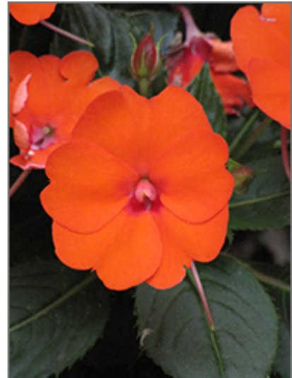
SunPatiens Compact Electric Orange New Guinea Impatiens flowers

SunPatiens Compact Electric Orange New Guinea Impatiens is a dense herbaceous annual with a mounded form. Its medium texture blends into the garden, but can always be balanced by a couple of finer or coarser plants for an effective composition.