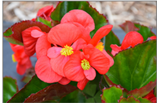
Big Red Green Leaf Begonia flowers

Big Red Green Leaf Begonia is an herbaceous annual with an upright spreading habit of growth. Its medium texture blends into the garden, but can always be balanced by a couple of finer or coarser plants for an effective composition.