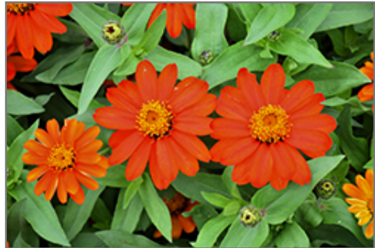
Zahara Fire Zinnia flowers

Zahara Fire Zinnia is recommended for the following landscape applications;