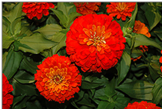
Dreamland Scarlet Zinnia flowers

Dreamland Scarlet Zinnia is recommended for the following landscape applications;