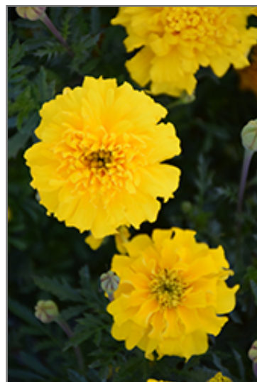
Cresta Yellow Marigold flowers