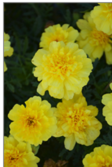
Alumia Yellow Marigold flowers