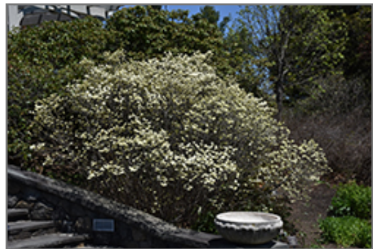
Dwarf Fothergilla in bloom