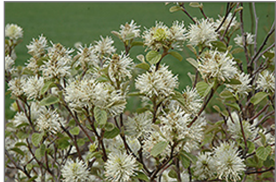
Dwarf Fothergilla flowers

This shrub does best in full sun to partial shade. It requires an evenly moist well-drained soil for optimal growth, but will die in standing water. It is not particular as to soil type, but has a definite preference for acidic soils, and is subject to chlorosis (yellowing) of the foliage in alkaline soils. It is somewhat tolerant of urban pollution. This species is native to parts of North America.