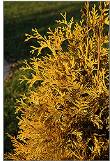
Yellow Ribbon Arborvitae in fall

This shrub does best in full sun to partial shade. It prefers to grow in average to moist conditions, and shouldn't be allowed to dry out. It is not particular as to soil type or pH. It is somewhat tolerant of urban pollution, and will benefit from being planted in a relatively sheltered location. Consider applying a thick mulch around the root zone in winter to protect it in exposed locations or colder microclimates. This is a selection of a native North American species.