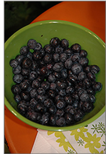
Peach Sorbet Blueberry fruit

This shrub is quite ornamental as well as edible, and is as much at home in a landscape or flower garden as it is in a designated edibles garden. It does best in full sun to partial shade. It does best in average to evenly moist conditions, but will not tolerate standing water. It is very fussy about its soil conditions and must have sandy, acidic soils to ensure success, and is subject to chlorosis (yellowing) of the foliage in alkaline soils. It is quite intolerant of urban pollution, therefore inner city or urban streetside plantings are best avoided, and will benefit from being planted in a relatively sheltered location. Consider applying a thick mulch around the root zone in winter to protect it in exposed locations or colder microclimates. This particular variety is an interspecific hybrid.