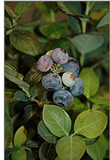
Peach Sorbet Blueberry fruit

Peach Sorbet Blueberry features dainty clusters of white bell-shaped flowers hanging below the branches in mid spring. It has green evergreen foliage. The glossy oval leaves turn an outstanding deep purple in the fall, which persists throughout the winter. It features an abundance of magnificent blue berries from early to mid summer.