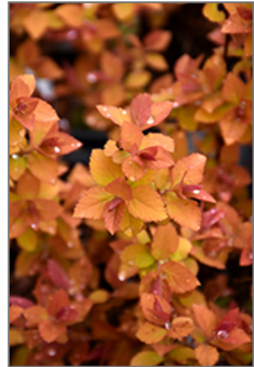
Double Play Big Bang Spirea foliage

This shrub should only be grown in full sunlight. It prefers to grow in average to moist conditions, and shouldn't be allowed to dry out. It is not particular as to soil type or pH. It is highly tolerant of urban pollution and will even thrive in inner city environments. This particular variety is an interspecific hybrid.