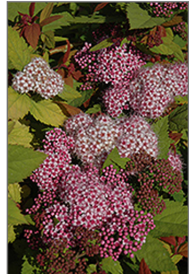
Double Play Big Bang Spirea flowers

This shrub will require occasional maintenance and upkeep, and is best pruned in late winter once the threat of extreme cold has passed. It is a good choice for attracting butterflies to your yard, but is not particularly attractive to deer who tend to leave it alone in favor of tastier treats. It has no significant negative characteristics.