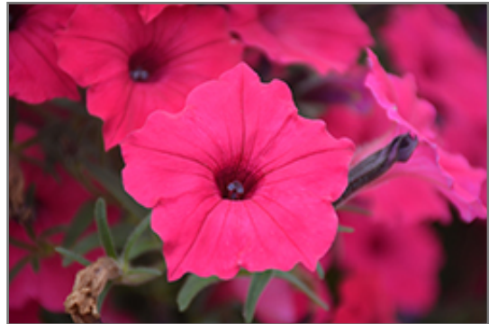
Supertunia Vista Fuchsia Petunia flowers

Supertunia Vista Fuchsia Petunia is recommended for the following landscape applications;