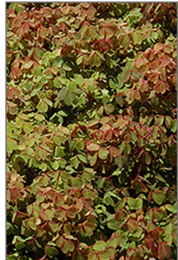
Sunset Velvet Shamrock foliage