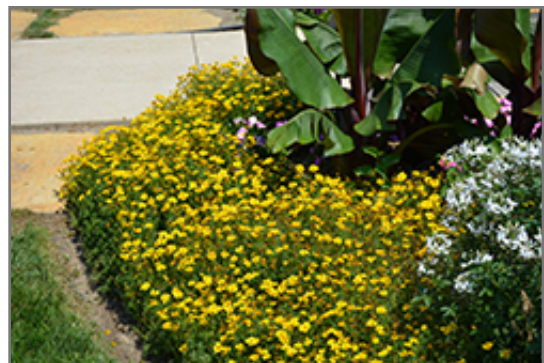
Goldilocks Rocks Bidens in bloom