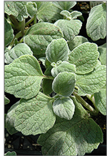
Nicoletta Swedish Ivy foliage