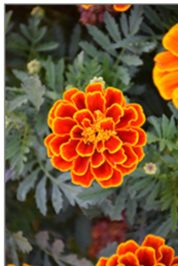
Durango Flame Marigold flowers