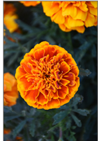
Bonanza Flame Marigold flowers