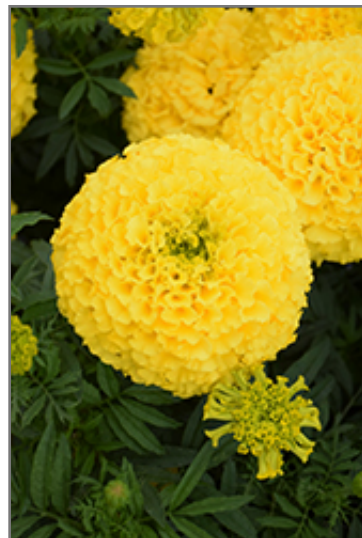
Marvel Yellow Marigold flowers

Marvel Yellow Marigold is recommended for the following landscape applications;