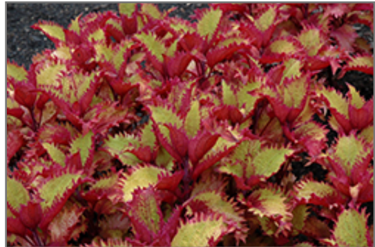
Henna Coleus foliage