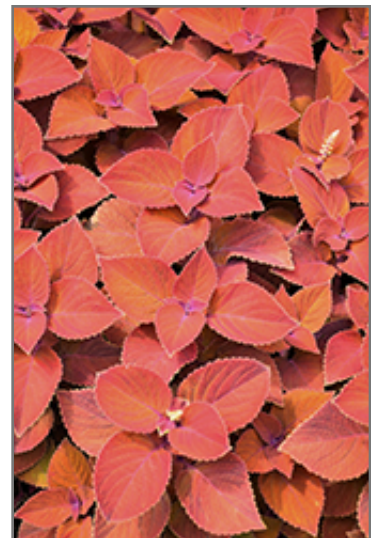
ColorBlaze Sedona Sunset Coleus foliage