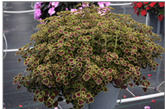
Burgundy Wedding Train Coleus