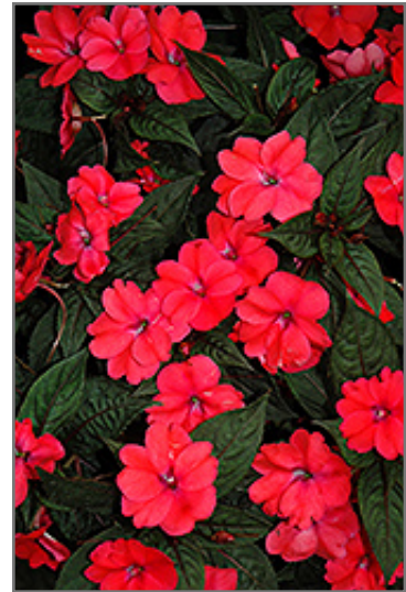
SunPatiens Compact Deep Rose New Guinea Impatiens flowers

SunPatiens Compact Deep Rose New Guinea Impatiens is a dense herbaceous annual with a mounded form. Its medium texture blends into the garden, but can always be balanced by a couple of finer or coarser plants for an effective composition.