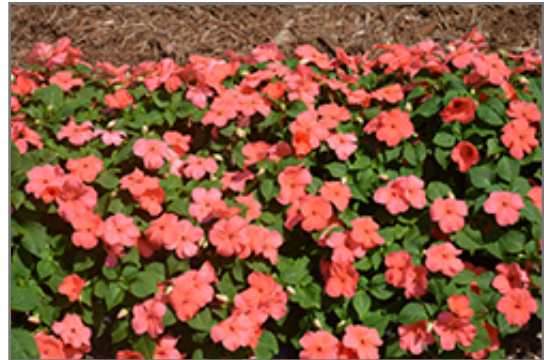
Super Elfin XP Melon Impatiens flowers

Super Elfin XP Melon Impatiens will grow to be about 10 inches tall at maturity, with a spread of 12 inches. When grown in masses or used as a bedding plant, individual plants should be spaced approximately 10 inches apart. Its foliage tends to remain low and dense right to the ground. This fast-growing annual will normally live for one full growing season, needing replacement the following year.