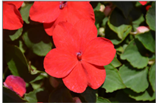
Super Elfin XP Melon Impatiens in bloom

Super Elfin XP Melon Impatiens is recommended for the following landscape applications;