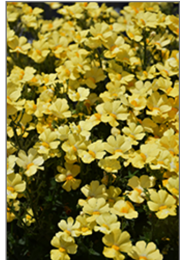
Sunsatia Lemon Nemesia flowers