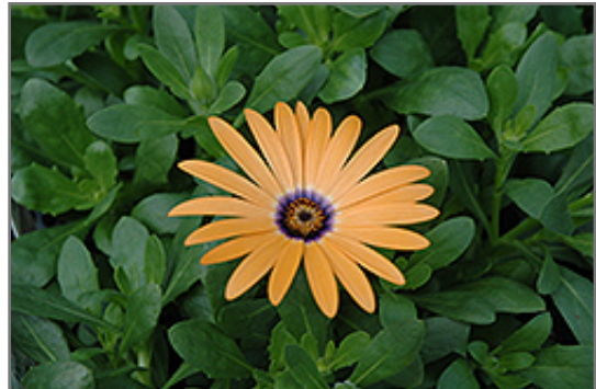
Orange Symphony African Daisy flowers

Orange Symphony African Daisy is recommended for the following landscape applications;