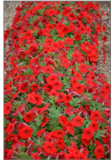
Easy Wave Red Petunia in bloom

Easy Wave Red Petunia is a fine choice for the garden, but it is also a good selection for planting in outdoor containers and hanging baskets. Because of its trailing habit of growth, it is ideally suited for use as a 'spiller' in the 'spiller-thriller-filler' container combination; plant it near the edges where it can spill gracefully over the pot. Note that when growing plants in outdoor containers and baskets, they may require more frequent waterings than they would in the yard or garden.