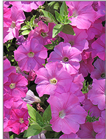
Easy Wave Pink Petunia flowers

Easy Wave Pink Petunia is a dense herbaceous annual with a trailing habit of growth, eventually spilling over the edges of hanging baskets and containers. Its medium texture blends into the garden, but can always be balanced by a couple of finer or coarser plants for an effective composition.