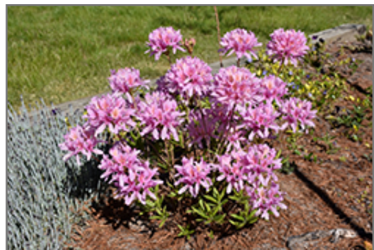
Orchid Lights Azalea in bloom