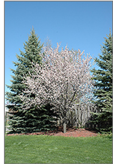
Newport Plum in bloom

This tree should only be grown in full sunlight. It does best in average to evenly moist conditions, but will not tolerate standing water. It is not particular as to soil type or pH. It is highly tolerant of urban pollution and will even thrive in inner city environments. This is a selected variety of a species not originally from North America.