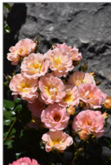
Peach Drift Rose flowers

This is a high maintenance shrub that will require regular care and upkeep, and is best pruned in late winter once the threat of extreme cold has passed. It is a good choice for attracting bees and butterflies to your yard. Gardeners should be aware of the following characteristic(s) that may warrant special consideration;