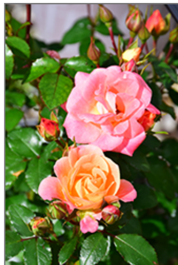
Peach Drift Rose flowers