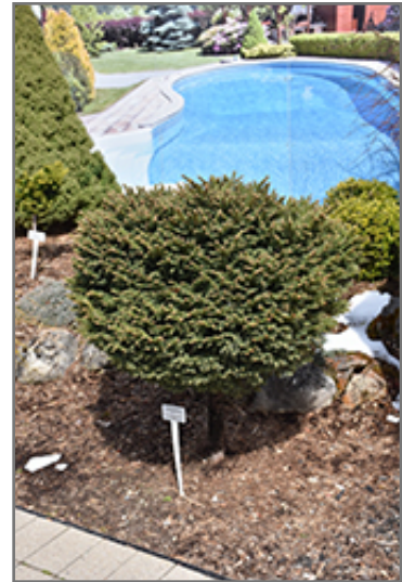
Little Gem Spruce (tree form)